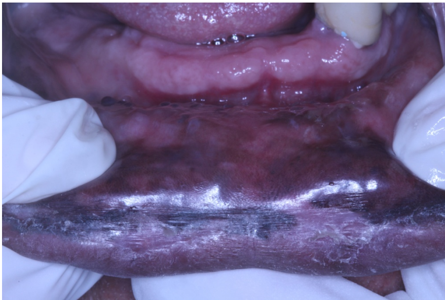
Fig. 1 Pigmentation of the lower labial mucosa.

Although oral pigmentation is a characteristic feature of LHS, the majority of the dentists are unaware of this entity. Dentists should be familiar with this process so an accurate diagnosis can be made.