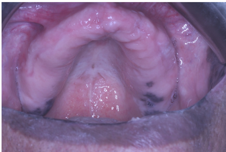
Fig. 3 Pigmentation on the maxillary alveolar mucosa.